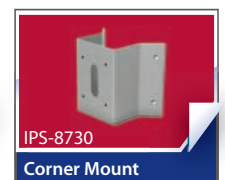
PRS-8730 Corner Mount